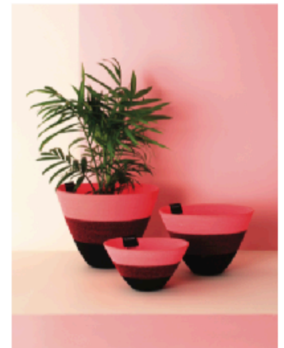
- Basket Series _Pink